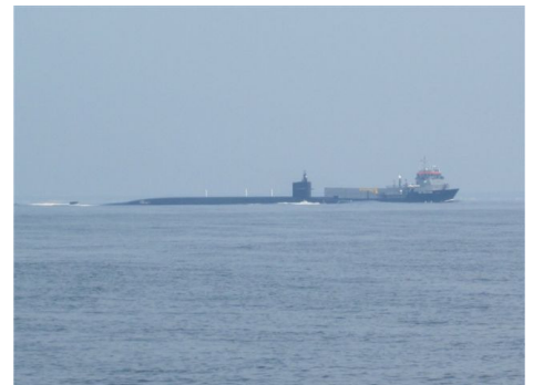
Submarine exits out of Kings Bay